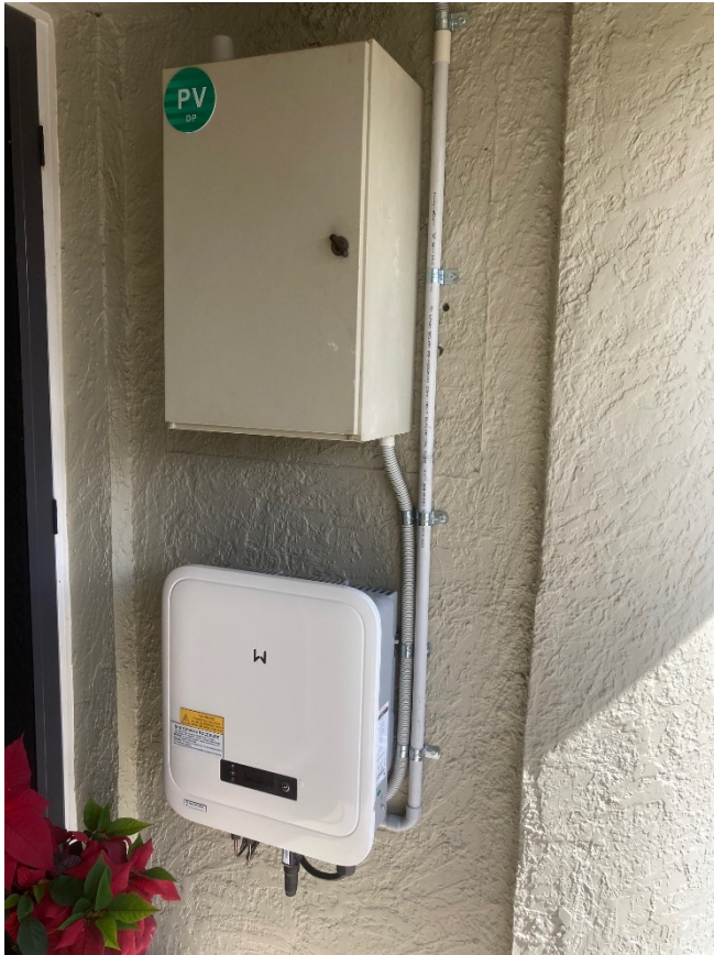
Inverter, typically installed nearby existing meter box.