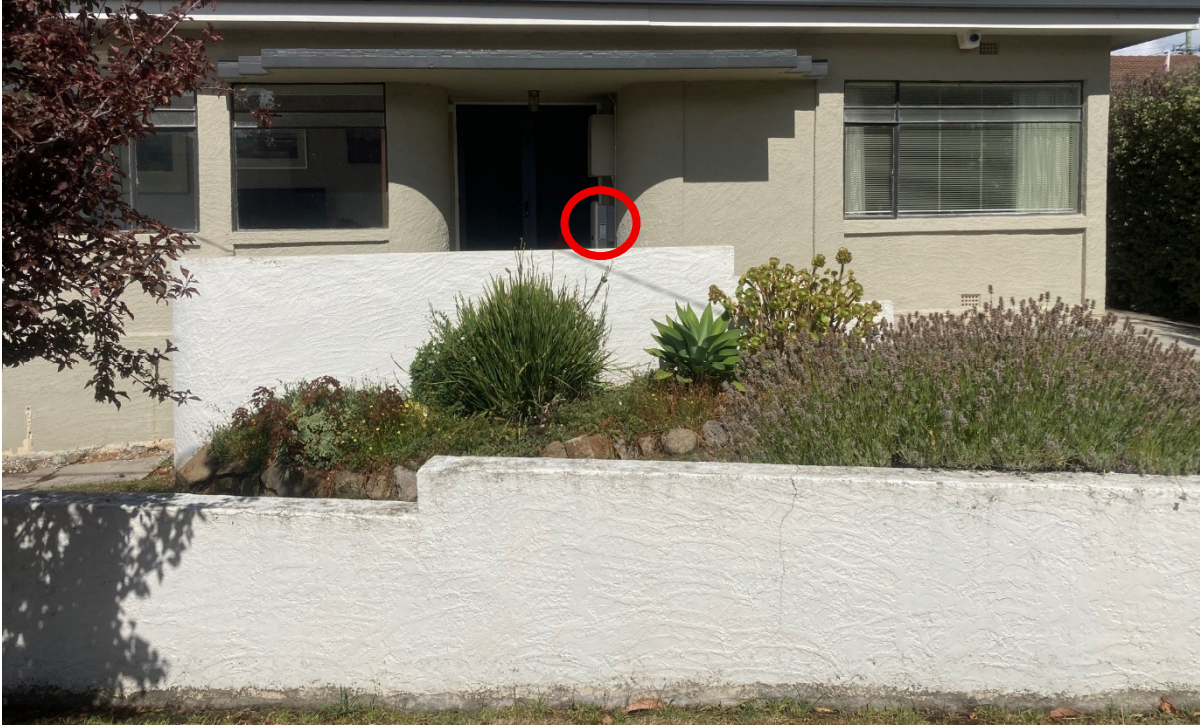
Inverter, street view.